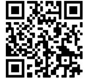
Table of Contents (Clickable)